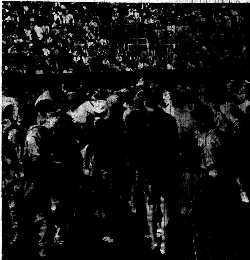
Lots of Spike Talent Just a few of the more than 1,500 athletes that crowded McCulloch Stadium and the football field Saturday as the 15th annual Willamette Relays unfolded before a big crowd in bright, sunlit weather.